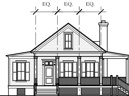
COLONIAL FARM HOUSE COTTAGE